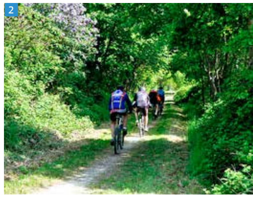
Old City Gate, Mortagne-Au-Perche The Voie Verte long-distance foot and cycle path La Perrière lace museum

Villa Fol Avril , 61110 Moutiers-au-Perche, tel +33 (0) 2 33 83 22 67, www.villafolavril.fr. Delightful boutique hotel with a pretty garden with pool and a great restaurant, in a hill village with exquisite 12th-century church.