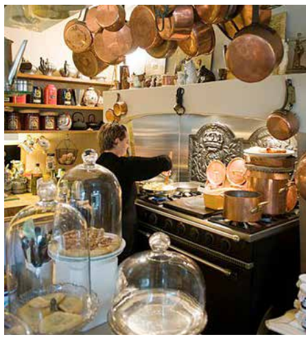
La Maison d'Horbé, La Perrière

The whole of the Perche is a Parc Naturel , and the park information centre is in one of the grandest manors, the 15th-century Manoir de Courboyer near Nocé (www.parc-naturelperche.fr/la-maison-du-parc.asp). As well as the dramatic tower itself, the grounds host an attractive restaurant, shop, a nature trail and a majestic herd of Percherons. Another way to get close to these famous animals is with Celine Maudet , who takes rides in a Percheron-drawn carriage – a lovely way to experience the countryside at natural pace (attelagenaturedansleperche.blogspot.fr). There are also great walking routes, including